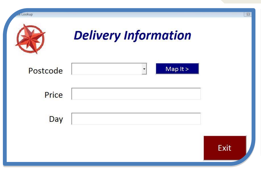
Fig 2: Simple tools to improve customer service